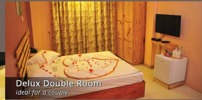
Delux Double Room ideal for a couple

▲ Area: 10 sq.m Number of rooms: 3 Pax: 2 Adults 1 Child