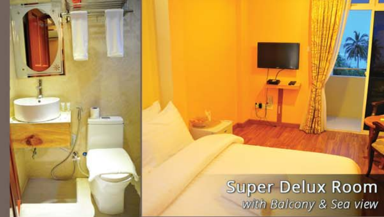
Super Delux Room with Balcony & Sea view

Hulhumalé is a reclaimed island which is connected to Ibrahim Nasir International Airport by land. Hulhumalé has embraced its potential and intends to further develop its facilities and conveniences to all who would set foot on its shores. Hulhumalé is ideal for tourists who arrive Maldives at night and require an overnight stay near airport before going to resort the next day. It is also the ideal place for travelers just to spend a fantastic holiday in Maldives in a more economical way.