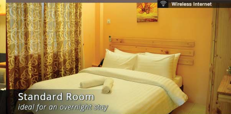
Standard Room ideal for an overnight stay

▲ Area: 9 sq.m Number of rooms: 3 Pax: 2 Adults