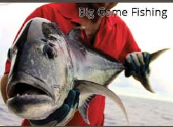
Big Game Fishing