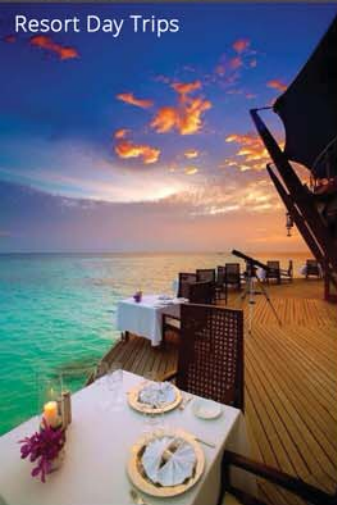
Resort Day Trips